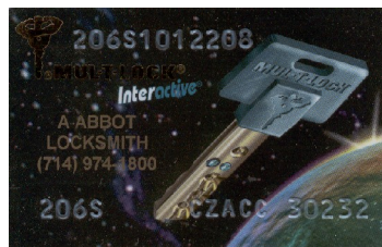
KEY CARD REQUIRED FOR KEY DUPLICATION

MUL-T-LOCK requires a “Key Card” or “Signature Card” to have copies made. Thus, it is impossible for employees to have duplicate keys made. ( Total key control ).